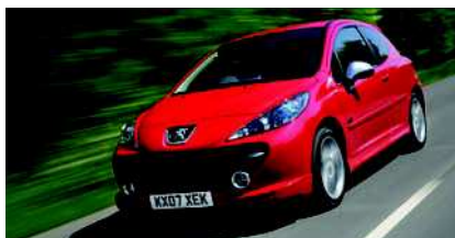
THE 1.6-LITRE TURBO UNIT DRIVES THE PEUGEOT 207