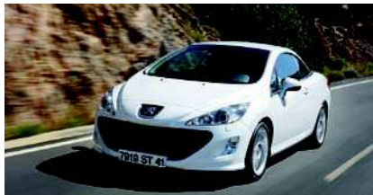
ENGINE DOWNSIZING AT ITS BEST IN THE NEW 308

BMW/PSA Peugeot Citroën's jointly developed turbo petrol engine has taken top honours for the third consecutive year in the 1.4-litre to 1.8-litre category, despite the arrival of the all-new Toyota Prius powertrain, which was an early favourite in this class.