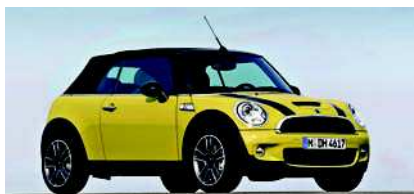
MINI HAS APPLIED BOSCH'S STOP/START TECHNOLOGY