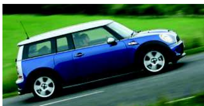
THE CLUBMAN BENEFITS FROM 260NM OF TORQUE